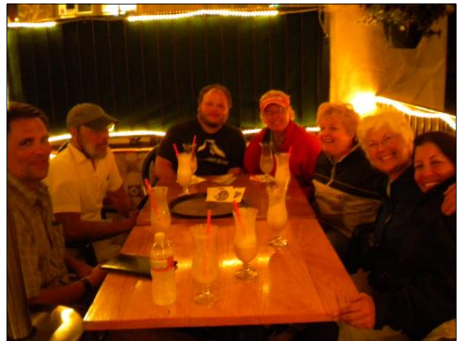
Avalon cruisers enjoying some time out of the wind!