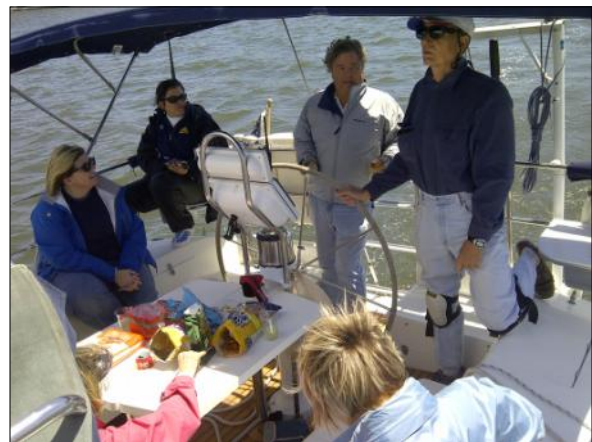
Back inside, time for some snacks...