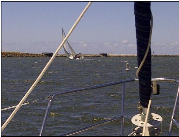
Looks a little windy today...

By 10 a.m., the morning showers had passed and the sun came out! Around 11 a.m., the boat was ready, gear was stowed, the main was reefed, and we were motor sailing out of the harbor to look at the race course out on the ocean.