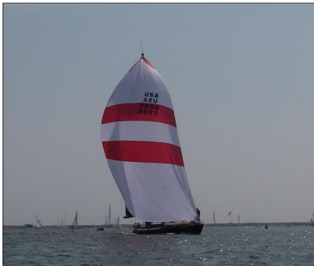
The legendary "Ragtime" flying down the channel during Cal Cup 2011.