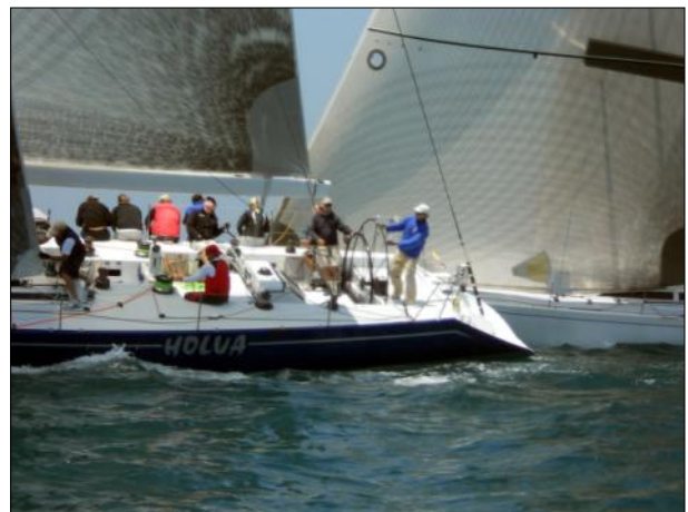
Holua and other classic "sleds" participate in the recent Cal Cup Regatta on Santa Monica Bay.