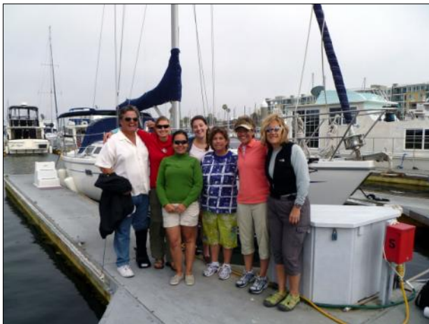
Crew members of "Journey" for the City of Hope Regatta. (Story and photos on page 7)

July will be our annual SUMMER PARTY—no business meeting, no speaker—we will have a fabulous BBQ on the porch and lots of fun and games.