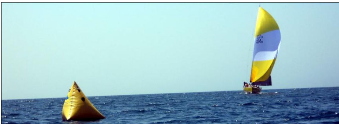
Cal Cup 2012 winner, Taxi Dancer , approaches the yellow leeward mark.