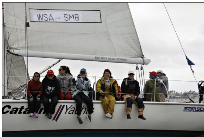
WSA's LEMWOD team, ready for action. (Story on page 5)

December's meeting features our holiday party and Installation Dinner. See page 6 for more information!