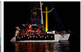
Help us convert My Time 3 (left) to WSA's boat parade entry ( Coco Puff on right from 2012's winning parade)